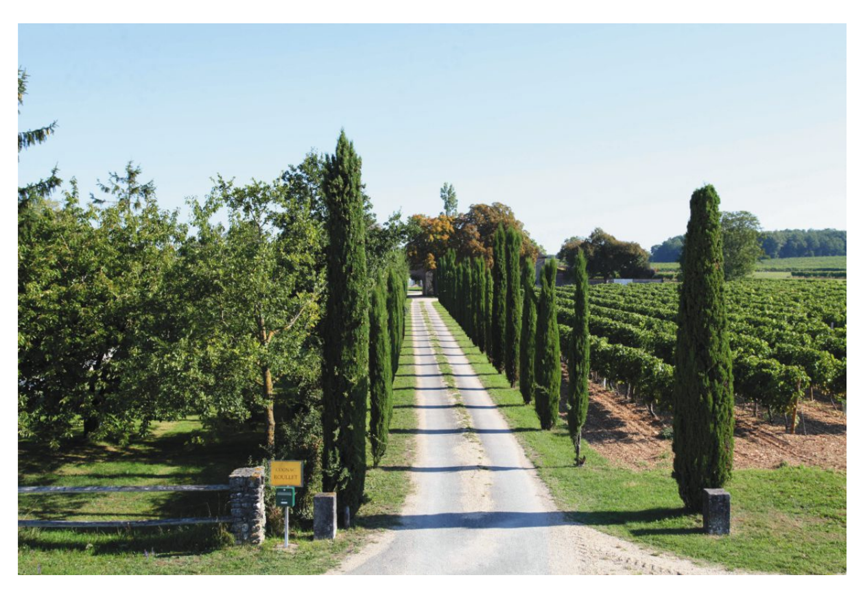
Cypress alley, «world tour» beginning of Roullet Cognac

COGNAC ROULLET Le Goulet 16200 FOUSSIGNAC FRANCE